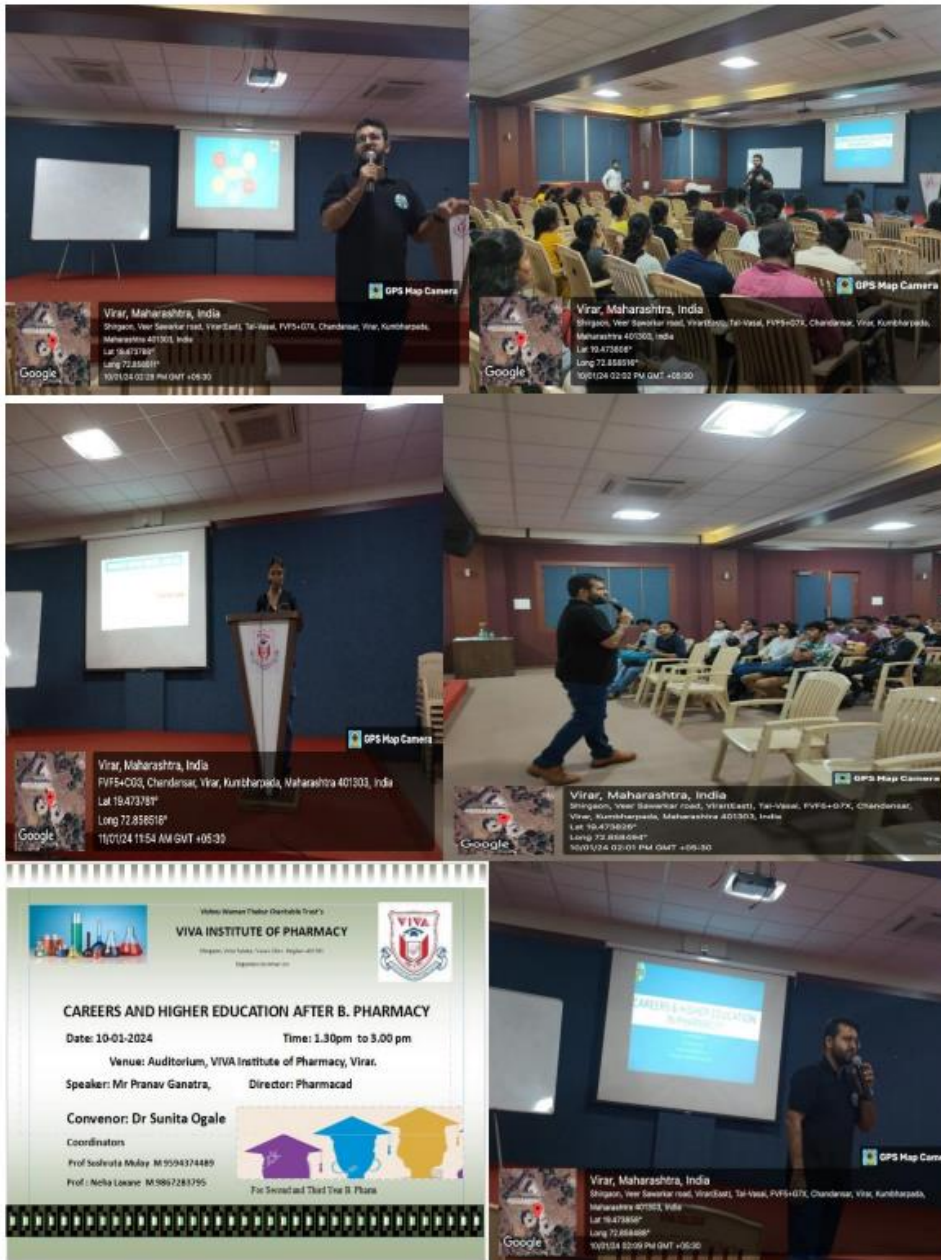
Seminar on “Careers and Higher Education After B. Pharmacy” conducted on 10-01-2024