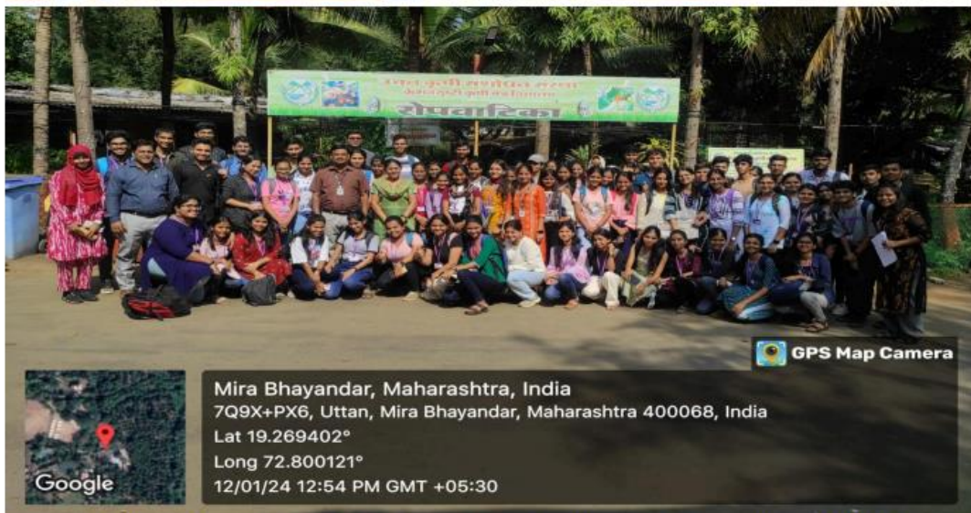
Medicinal Garden Visit - Keshav Srushti Uttan Mira Bhayandar Maharashtra - 12/01/2024