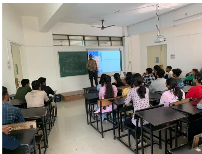
Speakers delivering lecture on Various Topics in Clinical Research & Pharmacovigilance