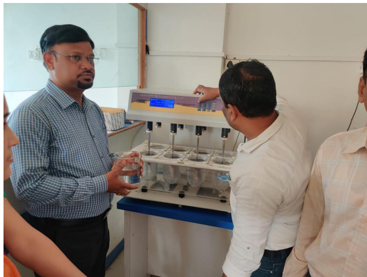
Hands on experience on Dissolution Apparatus